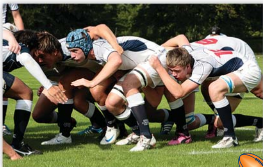
The 1st XV has had another highly successful season

It has been another exceptional season for the 1st XV, with a record of eight wins and two defeats narrowly failing to match the performance of the previous two seasons. For much of the term, the team has been placed highly in the Canterbury rankings, at one stage reaching fifth in Great Britain.