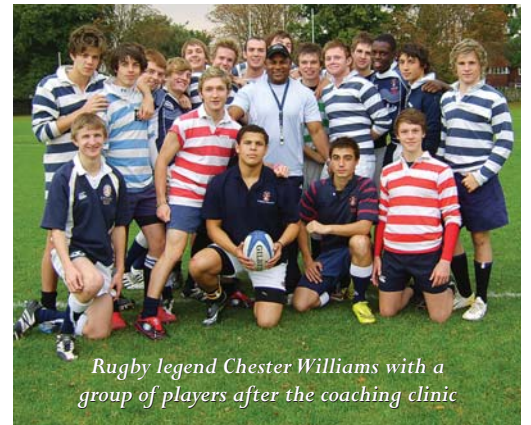
Rugby legend Chester Williams with a group of players after the coaching clinic

Rugby players from all age groups were delighted to meet Rugby World Cup winner Chester Williams when he ran two afternoon coaching clinics at Epsom College this term.